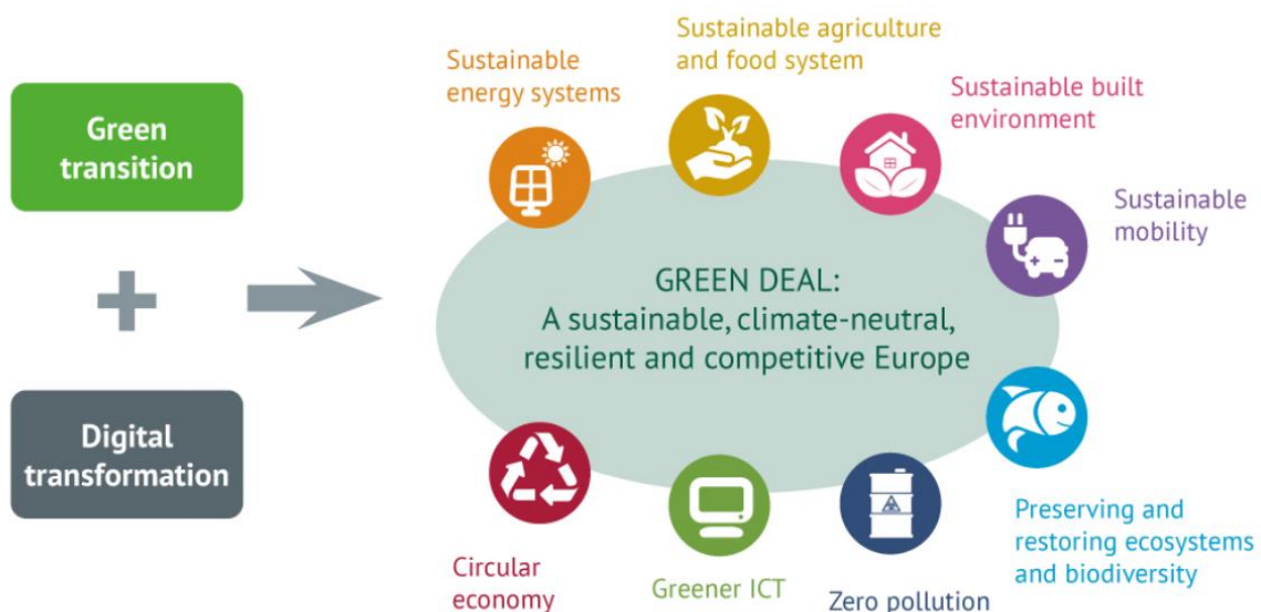
Figure 2: Green transition, digital transformation and the European Green Deal (Hedberg and Šipka, 2020)

Policy makers must recognise the importance of digitalisation in the water sector to dramatically advance the management of water. Designed and implemented at scale, digital solutions in the water sector may have the potential to enable a shift to integrated water assessments that better reflect the interconnected array of relationships and feedback loops that make up the water cycle. New digital solutions can generate data and insights to inform the design of more effective interventions in the form of policies and measures and may improve the transparency and efficiency of the decision-making within integrated water resources management. More accurate, affordable and frequent on-the-ground monitoring of water quality and quantity can help improve and raise the ambition of regulations, while more effective communication can strengthen the link with society (e.g. consumers) while having a positive impact on the environment. Data can make policies more tangible, better understood and more widely accepted. Digitalisation in the water sector represents the very essence of the Twin Transition that is needed to contribute to the implementation of the EU's Green Deal.